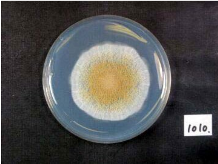
Colony on CD plate