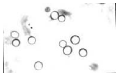
Photographs of conidiophore