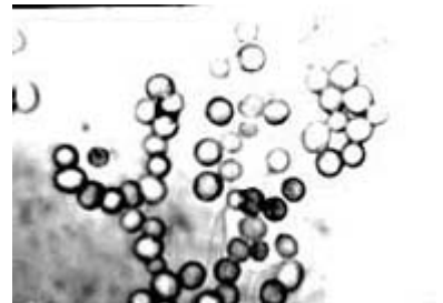
Photographs of conidiophore