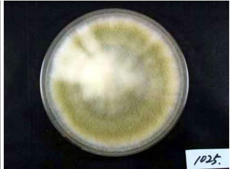
Colony on koji extract plate