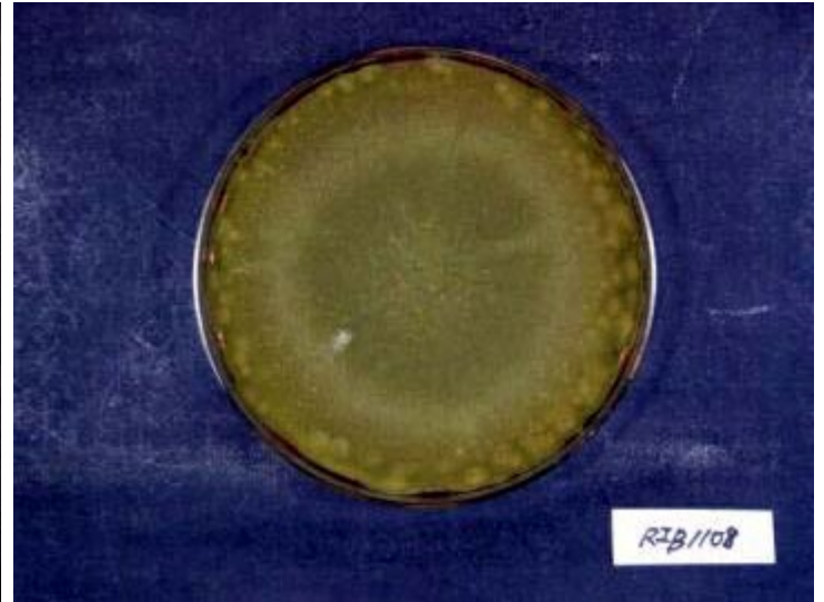
Colony on koji extract plate