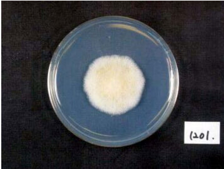
Colony on CD plate