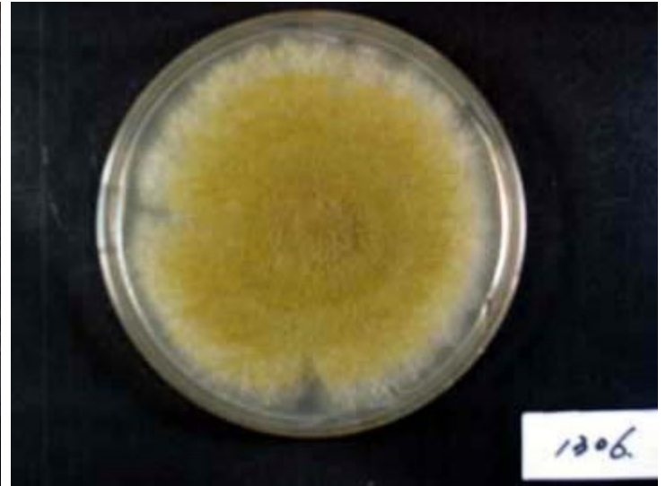
Colony on koji extract plate