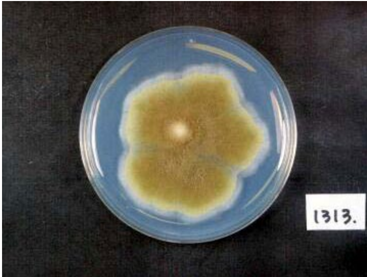
Colony on CD plate