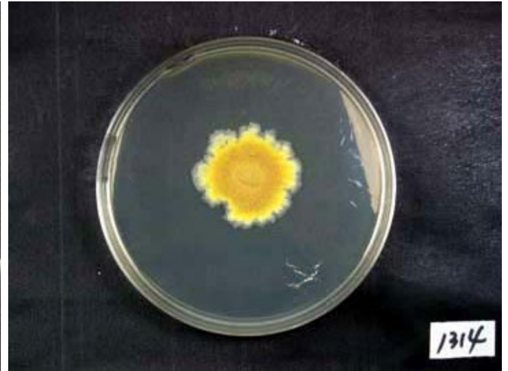
Colony on koji extract plate