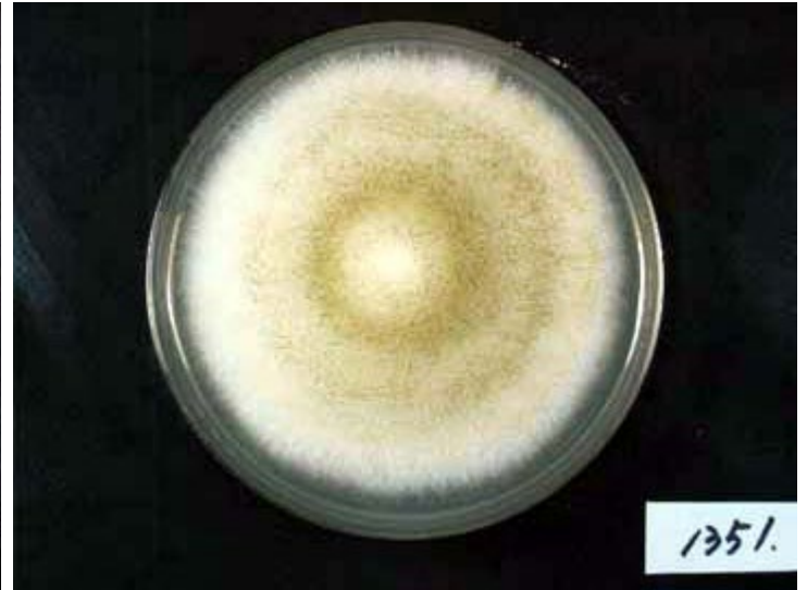
Colony on koji extract plate