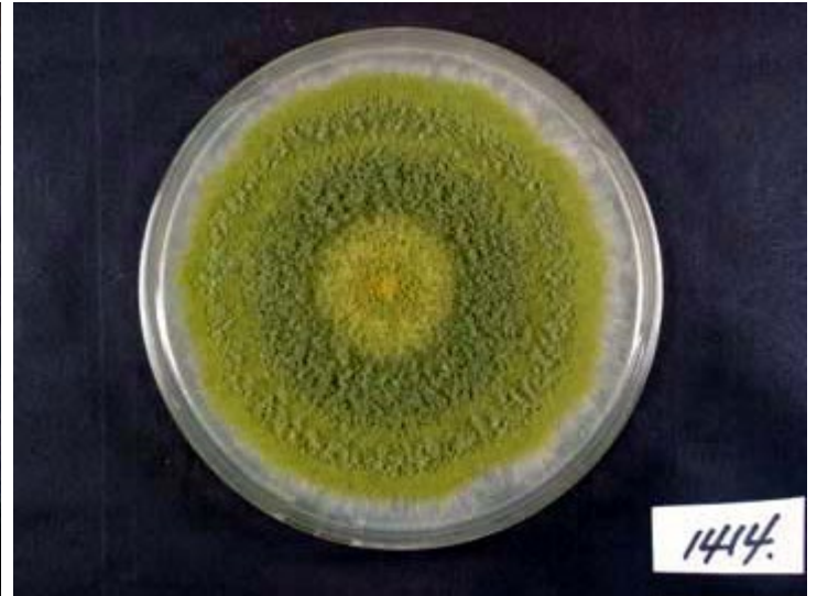
Colony on koji extract plate