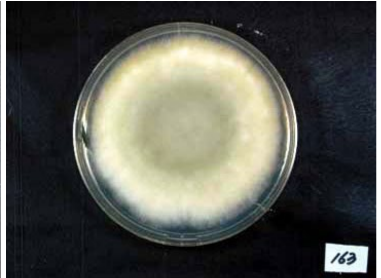
Colony on koji extract plate