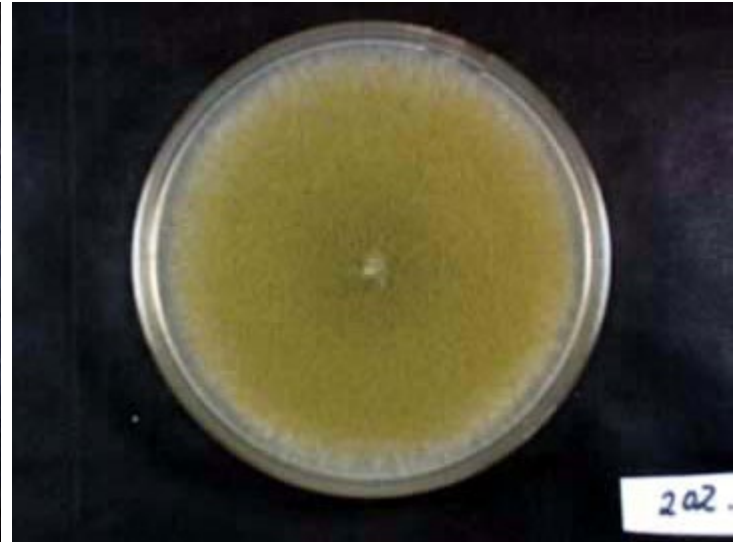
Colony on koji extract plate