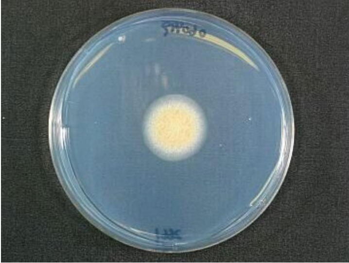
Colony on CD plate