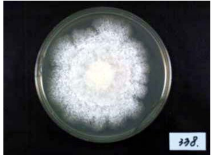
Colony on koji extract plate