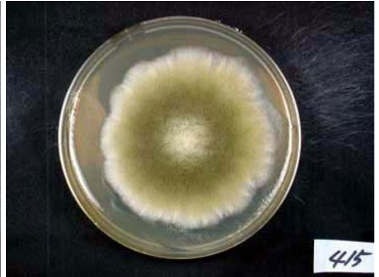
Colony on koji extract plate