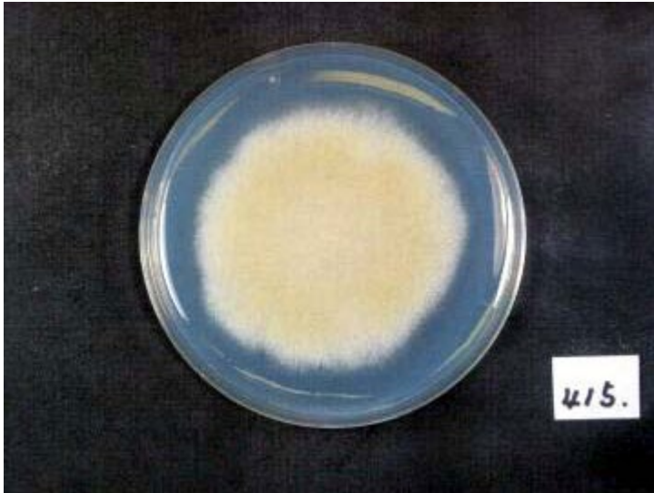
Colony on CD plate