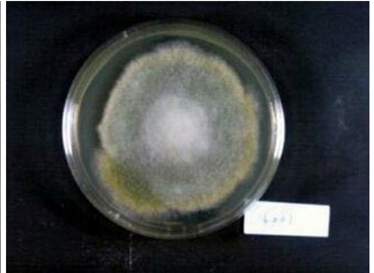
Colony on koji extract plate