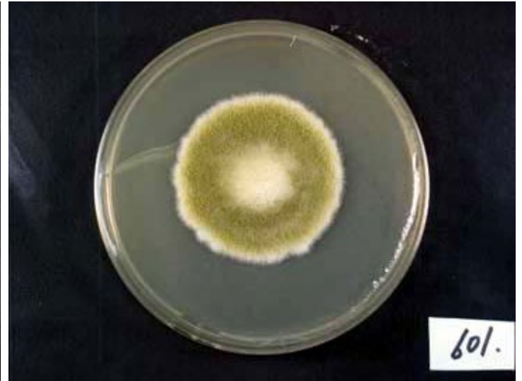
Colony on koji extract plate