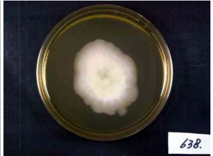
Colony on koji extract plate