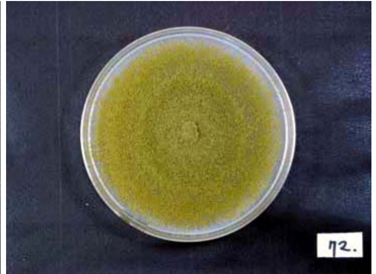
Colony on koji extract plate