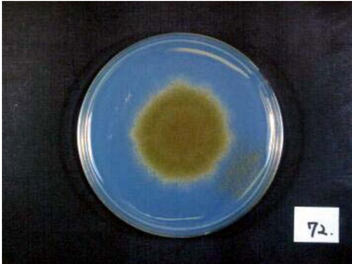
Colony on CD plate